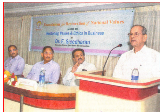
Dr. Sreedharan at the FRNV Kerala Chapter Meeting

Dr. E Sreedharan, President, FRNV met with the members of the FRNV Kerala Chapter on 1st April 2011 in Trivandrum. He also delivered a lectured titled "Ethics & Values in Business".