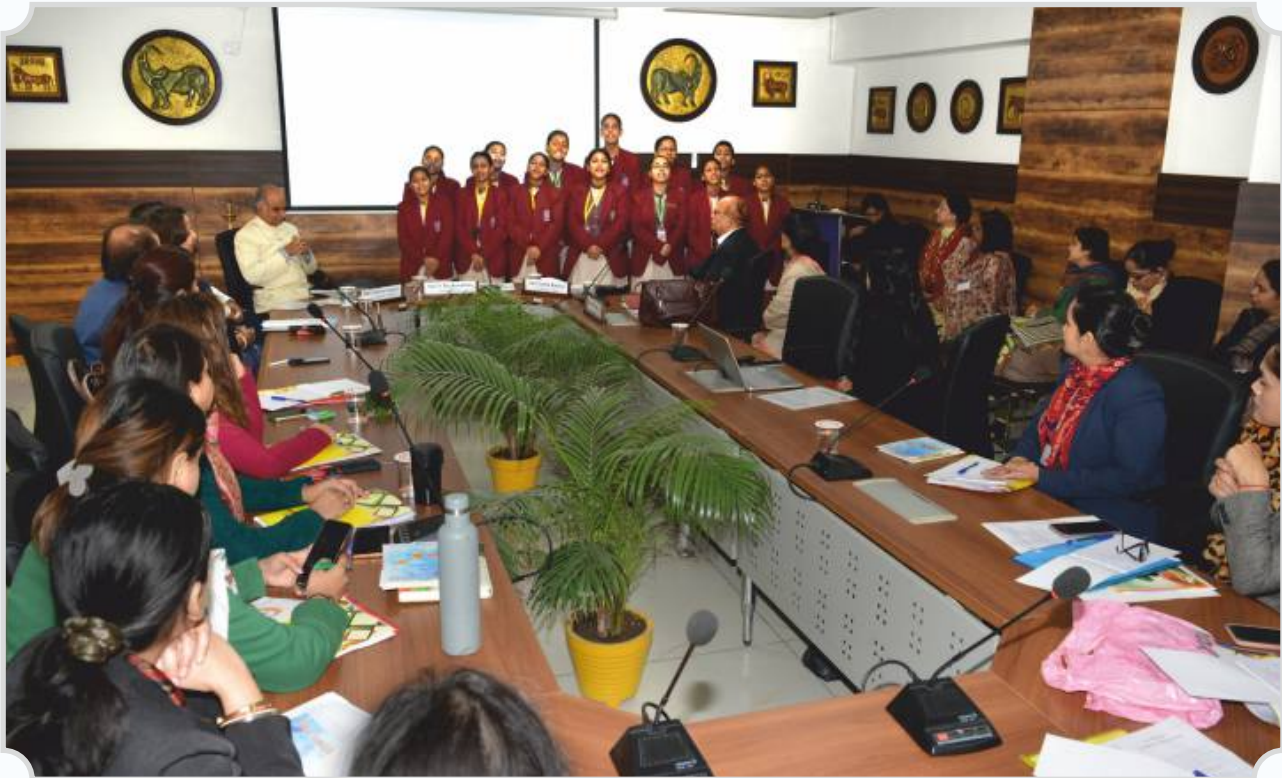
Value Education Workshop at M L Khanna DAV Public School, Dwarka, New Delhi