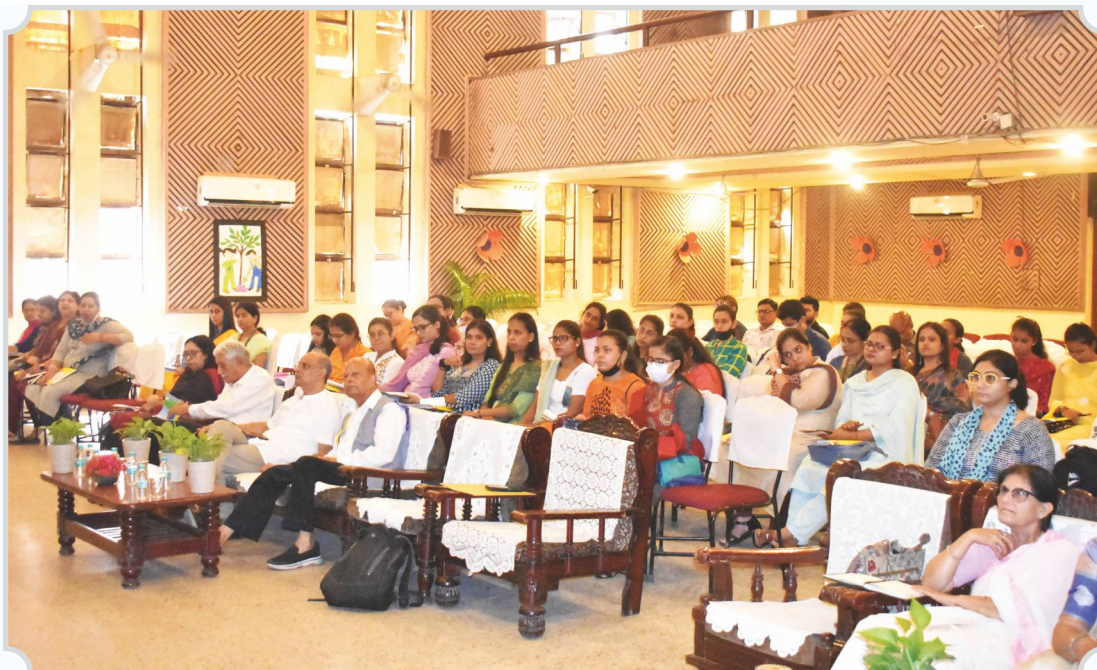
School Workshop at Balvantray Mehta Vidya Bhawan, Greater Kailash, New Delhi