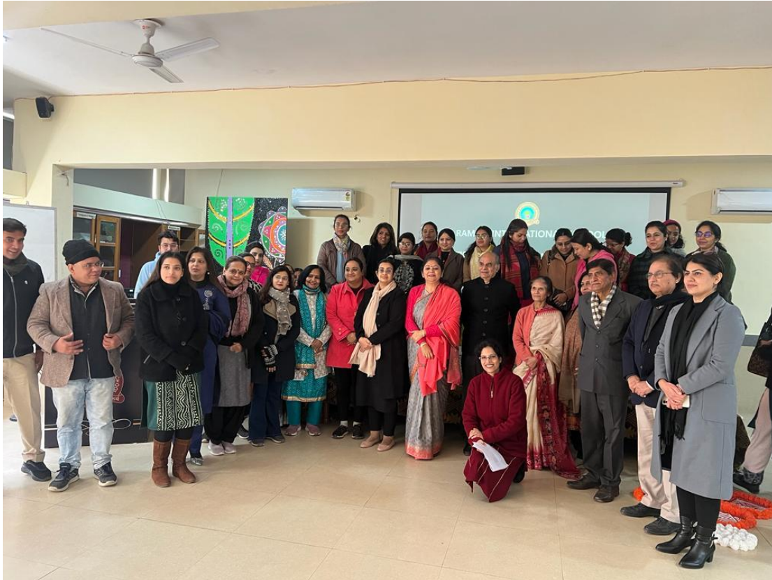
With the participants at the School Workshop 20.01.2024